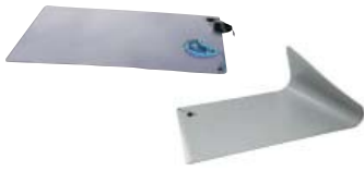
Table Mats and floor Runners

LABESTAT mats are made from a rugged synthetic rubber resistant to hot solder, fluxes and chemicals. The underside layer is black conductive, the top grey layer, glare free surface, has a resistance from 10^7 to 10^9 \Omega .